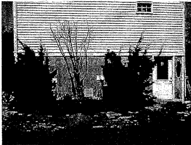
REAR VIEW - 04/24/2013